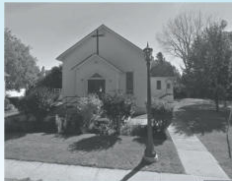
St. Andrew, Sackets Harbor