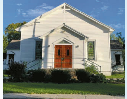
Saint Andrew's Sackets Harbor