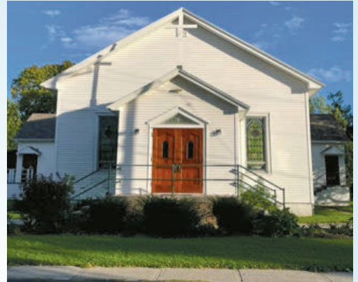
Saint Andrew's Sackets Harbor