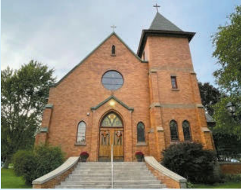
Immaculate Conception Brownville