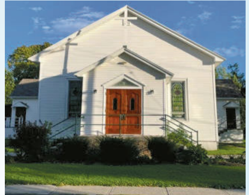
Saint Andrew's Sackets Harbor