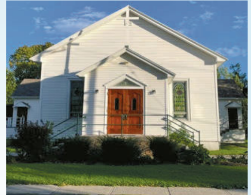
Saint Andrew's Sackets Harbor