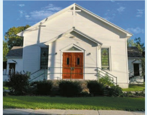
Saint Andrew's Sackets Harbor