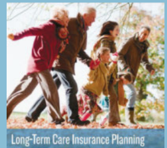
Long-Term Care Insurance Planning