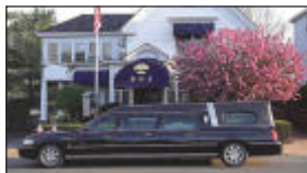
(Large New Addition Just Added)