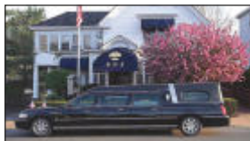
(Large New Addition Just Added)