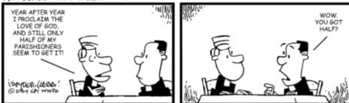
14th SUNDAY IN ORDINARY TIME

The celebration of our country’s independence gives us cause to reflect on the gift of freedom. We treasure the liberties our country provides, but are they the real source of freedom? True freedom is a gift given to us by God, not by the world. In fact, the world robs us of freedom by tethering us to a need for money, power, possessions, and prestige as vehicles to success and measures of self-worth. Even though we possess certain liberties, we are held captive by a system that sees no value in the Cross of Christ. It is no wonder Jesus sent his seventy-two disciples into the world with only what they were wearing. The freedom given to us by God is a matter of the heart and requires detachment from the very things we think we cannot do without. A heart secure in God’s peace is something no one can take away and something really worth dying for.