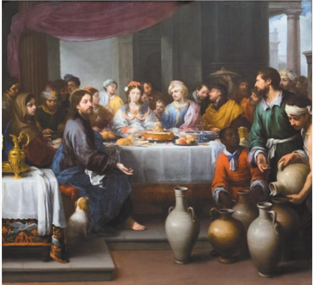
The wedding at Cana