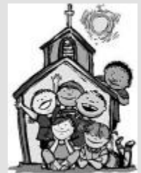
This Photo by