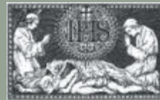
The Most Holy Name of Jesus

In Philippians 2 , Saint Paul tells us that "At the name of Jesus every knee should bow, of things in heaven, and things in earth, and things under the earth; and every tongue should confess that Jesus Christ is Lord." From the earliest days of Christianity, Christians have known the great power of Jesus' Holy Name. As the once-popular hymn commanded: