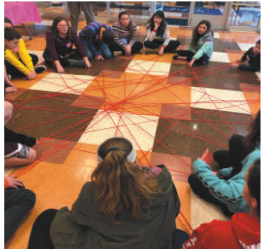
THE 2020 CONFIRMATION CLASS attended a retreat day on Sunday, March 10. During the pictured activity, the children created a "Web of Cooperation," by tossing a ball of yarn to one another and calling out their Confirmation name.

The celebration of the Eucharist and a reception will be held at the Cathedral Basilica of Saints Peter and Paul on Saturday, March 30, at 10:30am , for persons with disabilities and the deaf community within the Archdiocese of Philadelphia. All are welcome to attend. Please RSVP by March 20 by calling 215-587-3530, or by sending an email to opd@archphila.org , with the number of people attending and any accommodations that may be needed. Accessible parking is available. Please arrive by 10am.