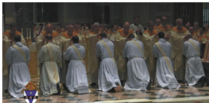
2019 Ordination at the Cathedral Basilica of Saints Peter & Paul

We congratulate these men and pray that they have many happy years in ministry to the faithful of Philadelphia.