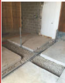
Preparing the concrete floor for new fixtures in the church - photo, left.

The parade of dumpsters has slowed as the demolition phase is yielding to the prep phase. With walls, attics, and ceilings torn down, the preparations for the rebuilding of the interior of the church consist of saw-cutting the concrete for the conduits for electrical and sound wiring, the stripping and leveling of floors for tile, and the trenching for new bathroom fixtures and plumbing. Contact and visits have been made by vendors with responsibility for flooring, alarm systems, sound systems, pews, stained glass installation, and lighting. Improvements in our building infrastructure include electrical panels and HVAC efficiency.