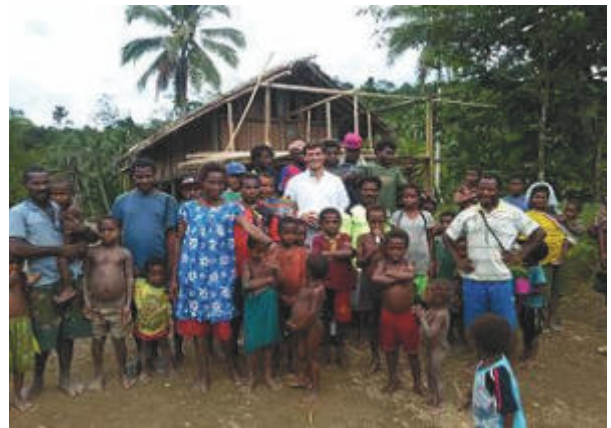
A priest from the Institute of the Incarnate Word makes a pastoral visit to the Catholics in a village of Papua, New Guinea.

A special collection envelope for the Missions was included with your weekly envelopes. Mission envelopes also will be available on the tables at the rear of Church.