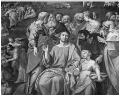
17 TH SUNDAY IN ORDINARY TIME

"There is a boy here who has five barley loaves and two fish, but what good are these for so many?" Then Jesus took the loaves, gave thanks, and distributed them to those who were reclining, and also as much of the fish as they wanted. - Jn 6:9, 11