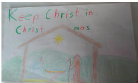
Category 4 — 1st Place Artist: Becket Geary