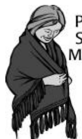
Prayer Shawl Ministry

Holy Communion and who is interested in becoming an Altar Server should contact the Parish Office as well.