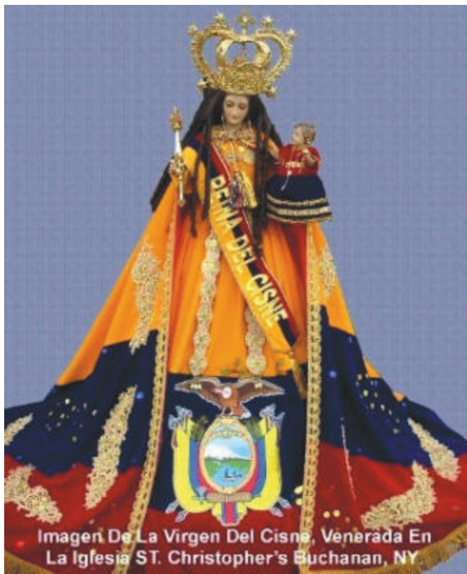
Imagen De La Virgen Del Cisne, Venerada En La Iglesia ST. Christopher's Buchanan, NY