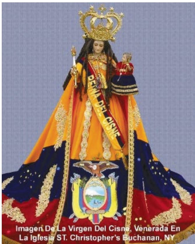
Imagen De La Virgen Del Cisne, Venerada En La Iglesia ST. Christopher's Buchanan, NY

Si desea el estado de contribución anual de la parroquia por favor solicite llamando al 914-7371046 ext 103 o por email a: espanol@chrispatparish.com