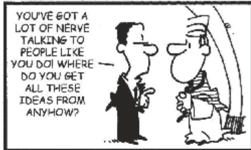
4TH SUNDAY IN ORDINARY TIME