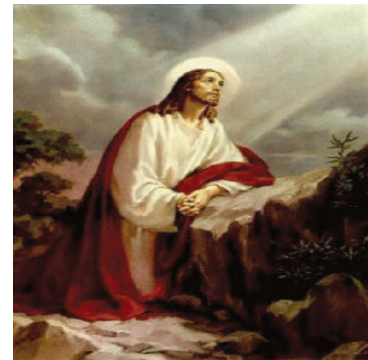
The Agony in the Garden

8-10pm- Adoration of the Blessed Sacrament