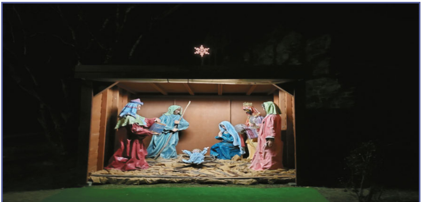
St. Peter's Creche outside Our Lady of the Rosary Chapel