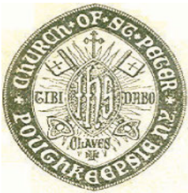
Original St. Peter's Seal