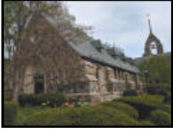
ST. JULIA CHURCH 374 BOSTON POST ROAD WESTON, MA