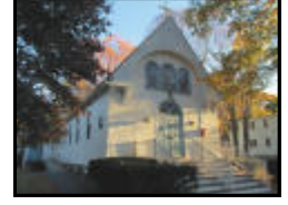
ST. JOSEPH CHURCH 142 LINCOLN ROAD LINCOLN, MA