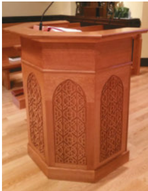
St. Julia Church

Thank you to all who have contributed to the Appeal. St. Julia Parish has reached 42% of our goal. Please consider donating. When you make a gift to the annual Appeal, you are helping put faith into action in countless and far-reaching ways and every gift makes a difference. Thank you.