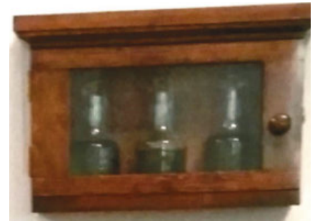
Ambry at St. Joseph Church

An Ambry is the name of the cabinet holding the three Holy Oils. It is usually located near the Baptismal Font. The oils have been blessed by the local Bishop during Holy Week.