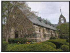
ST. JULIA CHURCH 374 BOSTON POST RD WESTON, MA