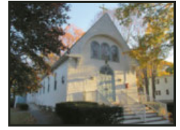
ST. JOSEPH CHURCH 142 LINCOLN RD LINCOLN, MA