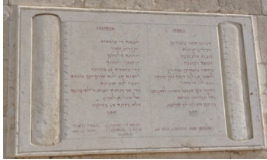
The Lord's Prayer in Aramaic and Hebrew