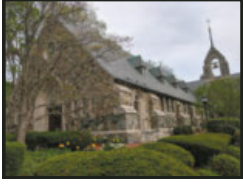
ST. JULIA CHURCH 374 BOSTON POST RD WESTON, MA