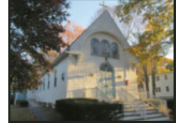
ST. JOSEPH CHURCH 142 LINCOLN RD LINCOLN, MA