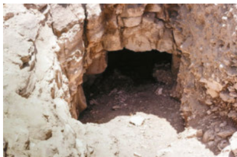
Ancient Cistern in Holy Land