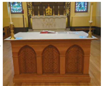
St. Julia Church, Weston

Today we have a simple table for our altar, usually made of wood or marble. In our Eucharist, we re-live the sacrifice Jesus made for us—giving up his life, so we can have eternal life. We give thanks to God for doing this for us, by offering our gifts of the best grapes made into wine and the finest wheat made into bread. We also offer up ourselves, sacrificing ourselves and promising God that we will help him build the Kingdom of Heaven here on earth. God replies to our gifts by giving us the nourishment we need—the Body and Blood of Christ himself. With Jesus within us, there is nothing we cannot accomplish!