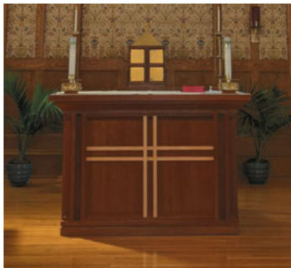
St. Joseph Church, Lincoln

Thank you to all who have contributed to the Appeal. St. Julia Parish has reached 51% of our goal. Please consider donating. When you make a gift to the annual Appeal, you are helping put faith into action in countless and far-reaching ways and every gift makes a difference. Thank you.