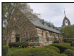
ST. JULIA CHURCH 374 BOSTON POST RD WESTON, MA