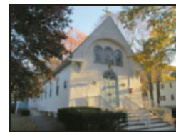
ST. JOSEPH CHURCH 142 LINCOLN RD LINCOLN, MA