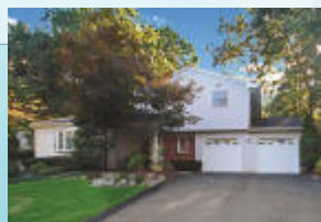
18 Bosko Drive Frost