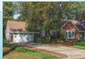
65 Patton Drive Lawrence Brook