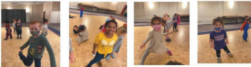
MUSIC WITH ELLEN