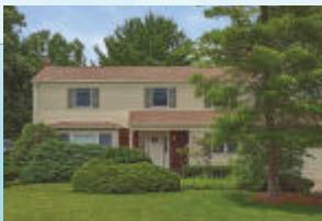
13 Guernsey Lane Colonial Oaks

557 Cranbury Rd, Ste 23, East Brunswick, NJ 08816