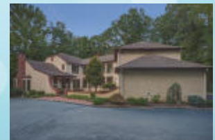
135 Fern Road Colonial Oaks

Thank you for the opportunity to EARN your trust, I am proud to be your choice!