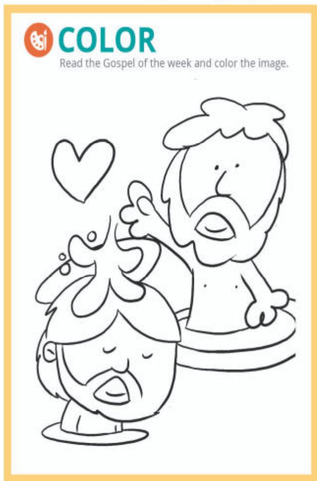
Baptism of the Lord • Mark 1:7-11