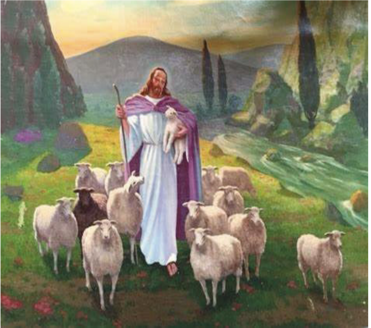
JESUS AND HIS FLOCK

LOVE GOD. LOVE ONE ANOTHER. GROW DISCIPLES.