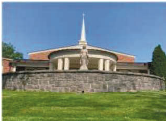
Upper Church and Parish Center