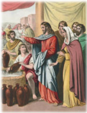
"The First Miracle"

"His mother said to the servants, "Do whatever he tells you." John 2:3-5