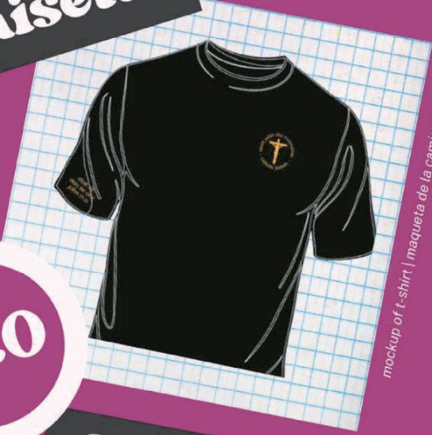
mockup of t-shirt | maqueta de la camiseta