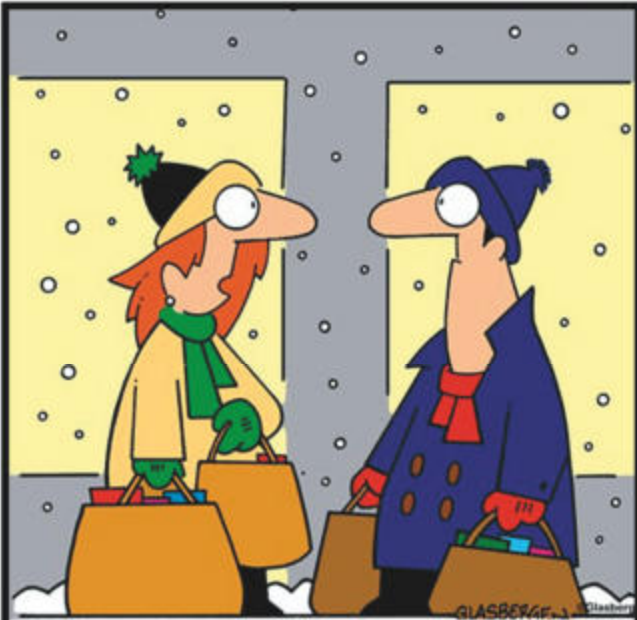
"I've got the holiday spirit — exhausted and cranky!"