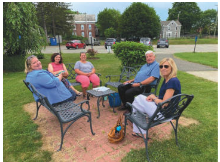
Meeting to prepare for a new year of Religious Education