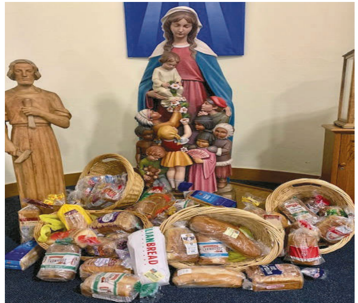
Just a loaf of bread can mean so much to so many!!

CLASSES will meet through April 10 . Parents will be contacted regarding the safe environment program called, "Circle of Grace" and classroom lessons.