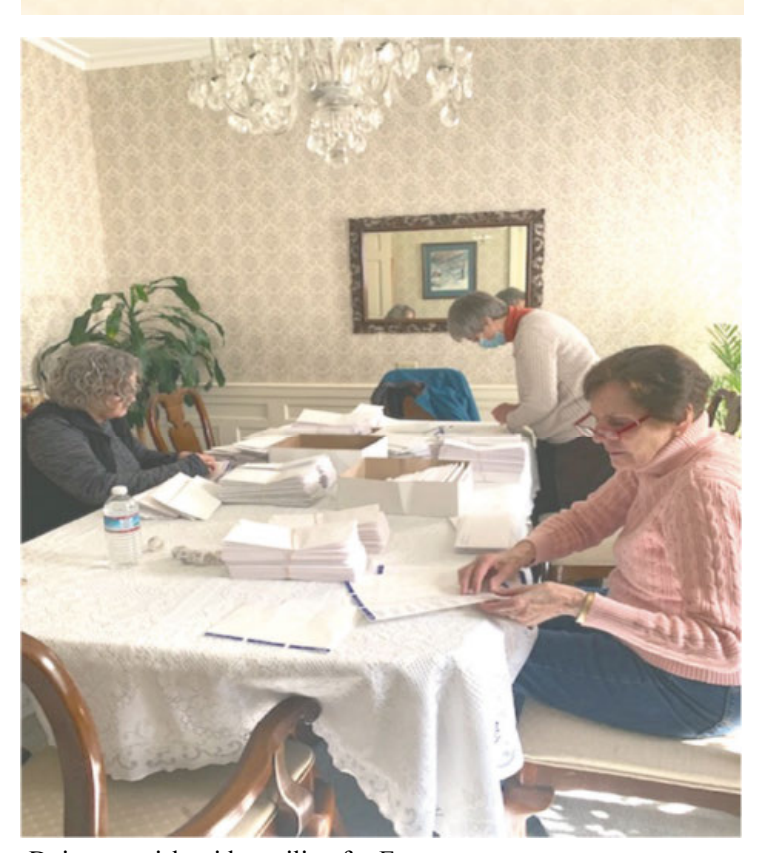
Doing a parish-wide mailing for Easter

March 20 total donations = 39 Total to date=163