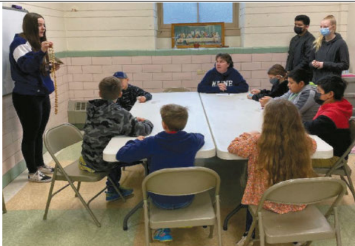
Learning how to pray the Rosary.

RECTORY will be closed Easter Monday, April 18.