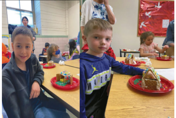
Having fun making Easter gingerbread houses