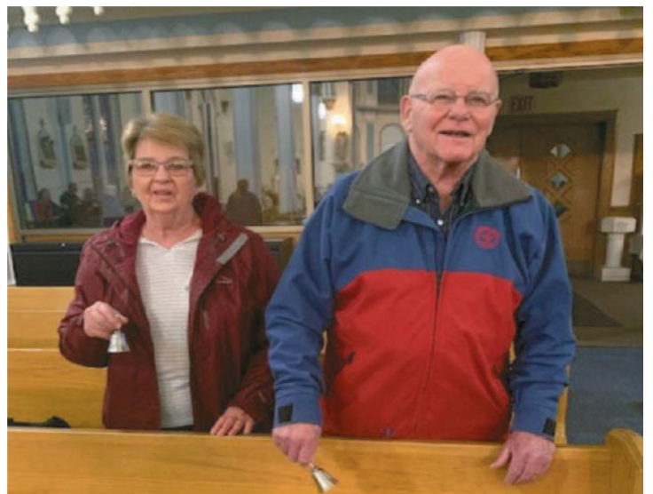
Sound of ringing the bells on Holy Thursday filled the church