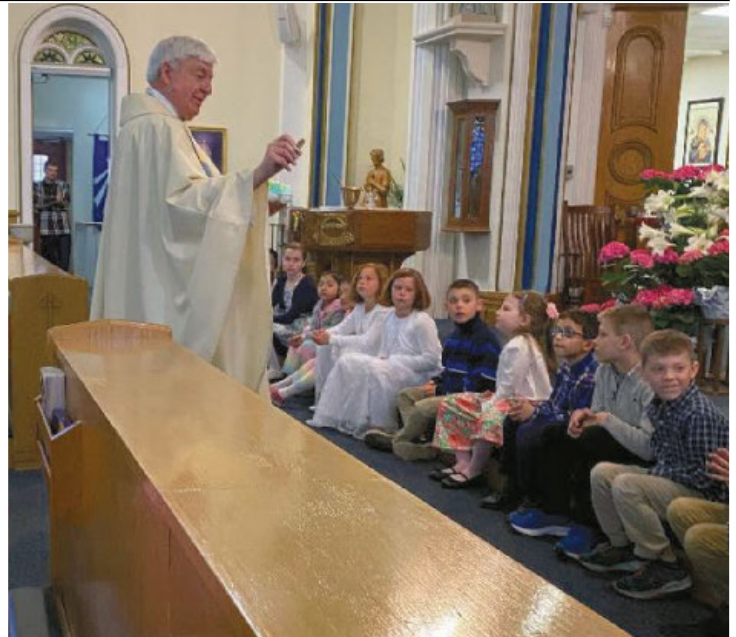
Listening intently to the meaning of the Easter story

Holy Trinity Church , 133 Main Street, Greenfield, will have a tag, jewelry, linen, toys, raffles and bake sale, Friday, May 6 , 9:00A-2:00P and Saturday, May 7 , 9:00A-1:00P.