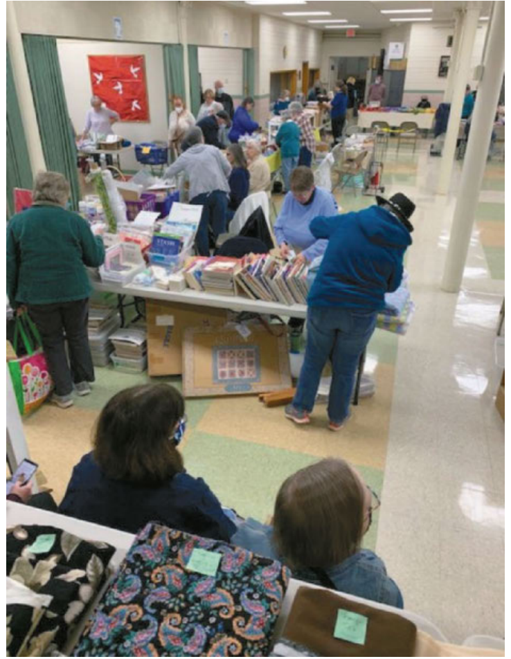
THANK YOU! On behalf of the Women's Group, we thank the vendors, customers, those who donated items and our workers for a very successful 6th annual Stash Bash. The Stash Bash Committee

PARISH COLLECTIONS Amounts not available at press time ANNUAL CATHOLIC APPEAL DONATIONS $12,800.00 as of March 25 THANK YOU!