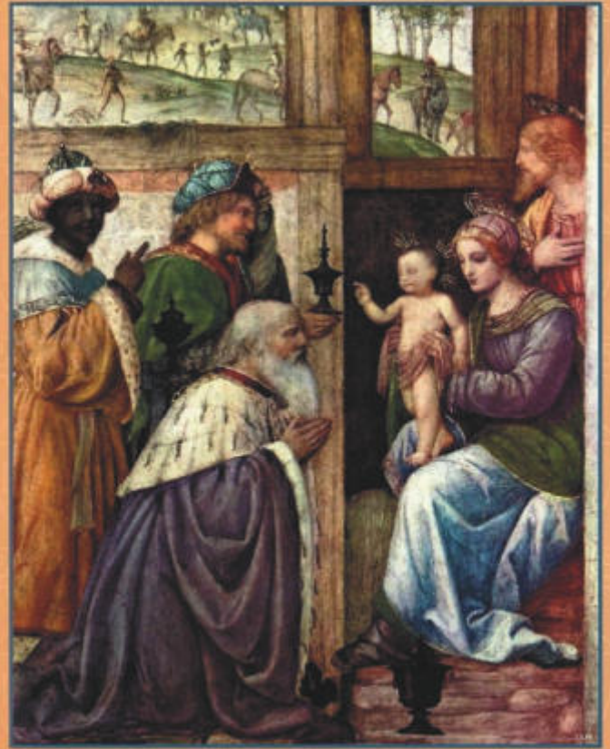
THE EPIPHANY of the Lord