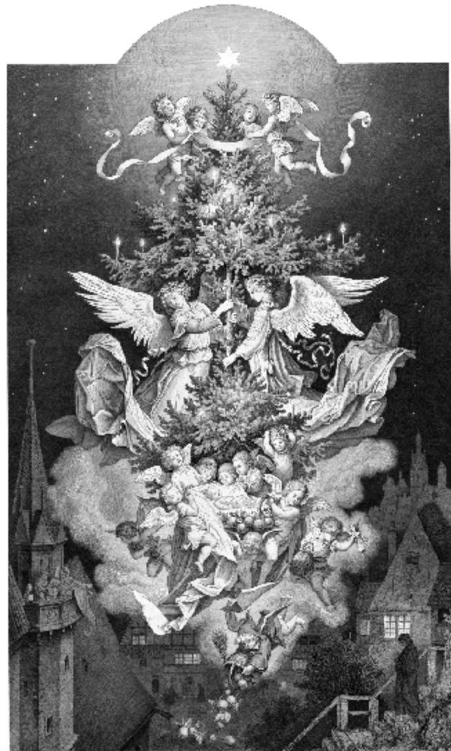
Shown is the wood engraving "The Christnacht" by Ludwig Richter, 1824

"Our Saviour, dearly-beloved, was born inlay: let us be glad. For there is no proper place for sadness, when we keep the birthday of the Life, which destroys the fear of mortality; and