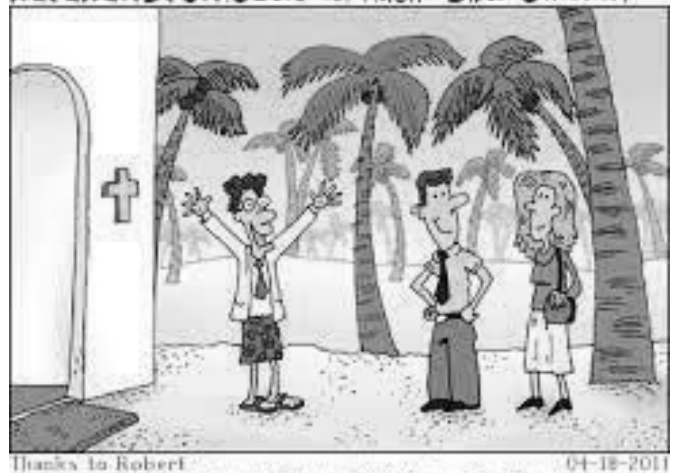
ON OUR ISLAND, EVERY SUNDAY IS PALM SUNDAY